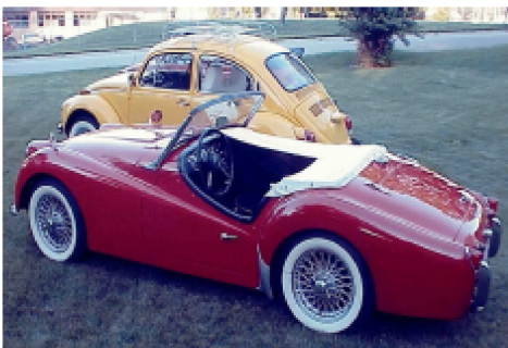
Tom Wachs TR-3

Bring Your Classic And Explore The Most Beautiful Country In America!