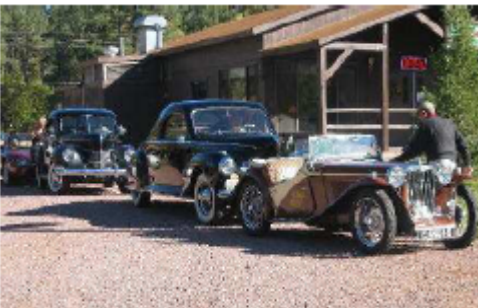
Eastern Arizona Road Trip